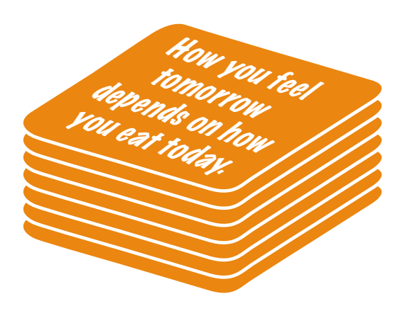
To help promote healthy choices, the Boston BestBites program provides table tents and coasters with slogans.