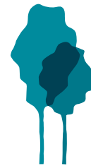
image. Quality-of-life (including streetscape and safety) improvements and marketing efforts can help overcome negative perceptions of a neighborhood, rendering it more attractive to retailers.

Many underserved communities have passed local ordinances limiting new liquor licenses, which can present a challenge for grocery store operators who sell alcohol. Los Angeles and San Francisco exempt grocery stores from their liquor store ban but continue to prohibit the sale of single-serving and malt liquor in areas with specific liquor-sales restrictions. San Francisco has adopted a “Deemed Approved” ordinance, which requires store operators to ensure that nuisance activities which are illegal or harmful to the community do not occur in or immediately near the premises. Other communities have negotiated voluntary “good neighbor” agreements with individual store owners.