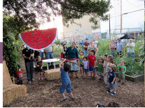
National Day of Action Eat-In Potluck Milagro Allegro Community Garden, Highland Park, CA

Saldivar-Tanaka & Krasny, 2004 Kuo & Sullivan, 2001