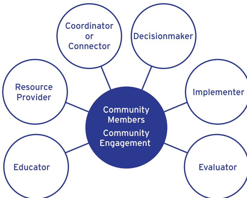
FIGURE 2. CENTRAL ROLE OF COMMUNITY ENGAGEMENT